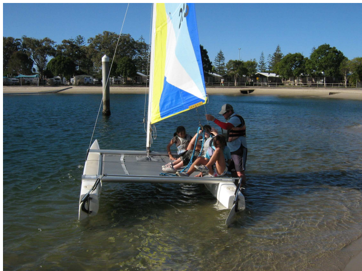
Students at camp

6/7 students attended a 3 day Camp at Education Queensland Tallebudgera camp.